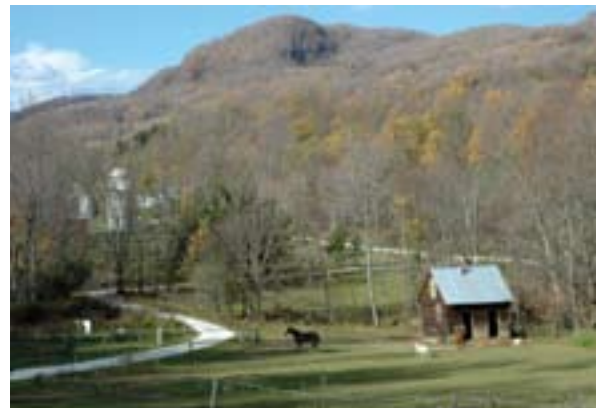
The Priests grow much of their own food—and brew their own beer—on BYB Farm.