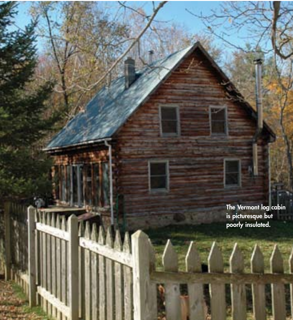
The Vermont log cabin is picturesque but poorly insulated.