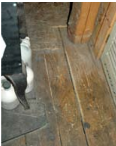
The couple should replace the UNEVEN SUB-FLOOR and install green insulated flooring.