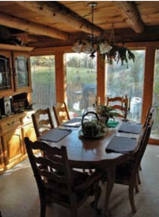
The rustic plank ceilings are charming, but they MAKE ROOMS DARK.