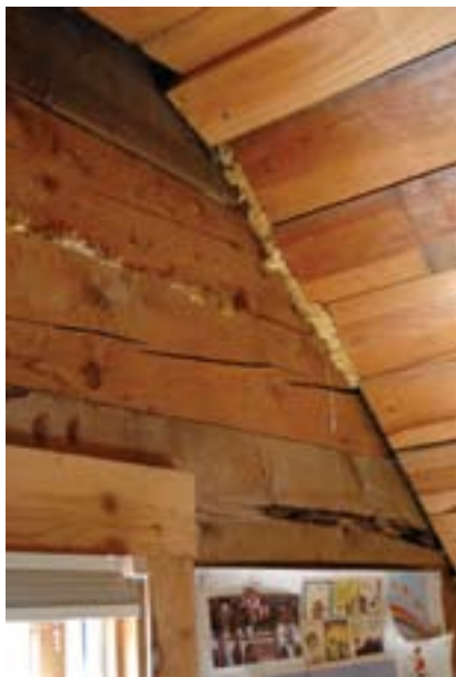
Previous efforts to CHINK CRACKS in the cabin still don't stop drafts.